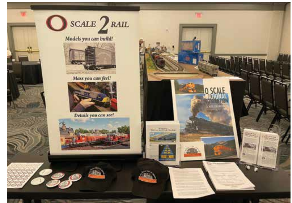
Below: Literature on display in the SIG room at the 2022 NMRA National Convention.

The project turned out to be more challenging than we had planned, and the layout was not operational until the very night before we were to leave, driving the layout to St. Louis from Maryland. The layout, structures, rolling stock, and O Scale Central signs and literature just barely fit in the SUV, but we made it. We set up the layout on Sunday morning, installed structures and details, placed the engines and cars on the track, and started operating.