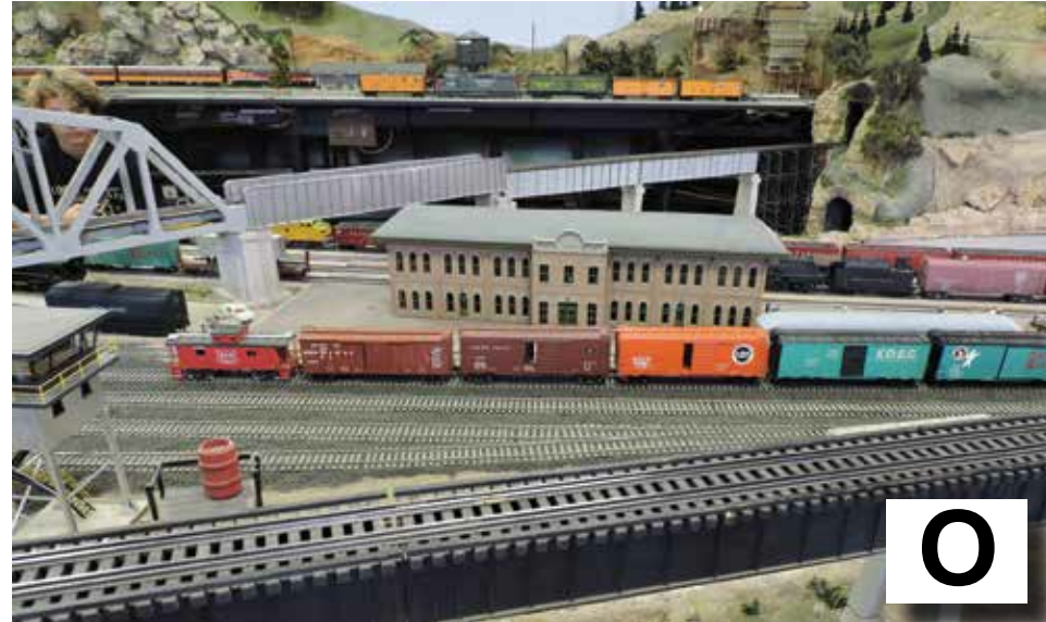
Above: Big Bend Railroad Club.

Like all project layouts, there is always a question of what happens after publication is complete. In this case, Wingate resided under a tarp on Tony’s porch until a family reunion loomed. O Scale Central was look-