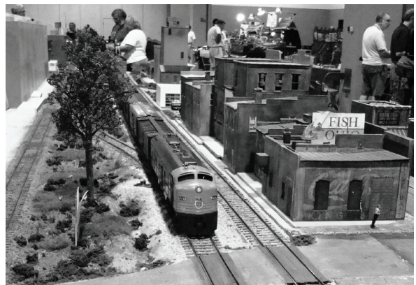
COOSE layout at Wooster National